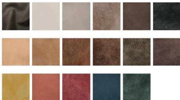
Sidecar - Pelli Vintage