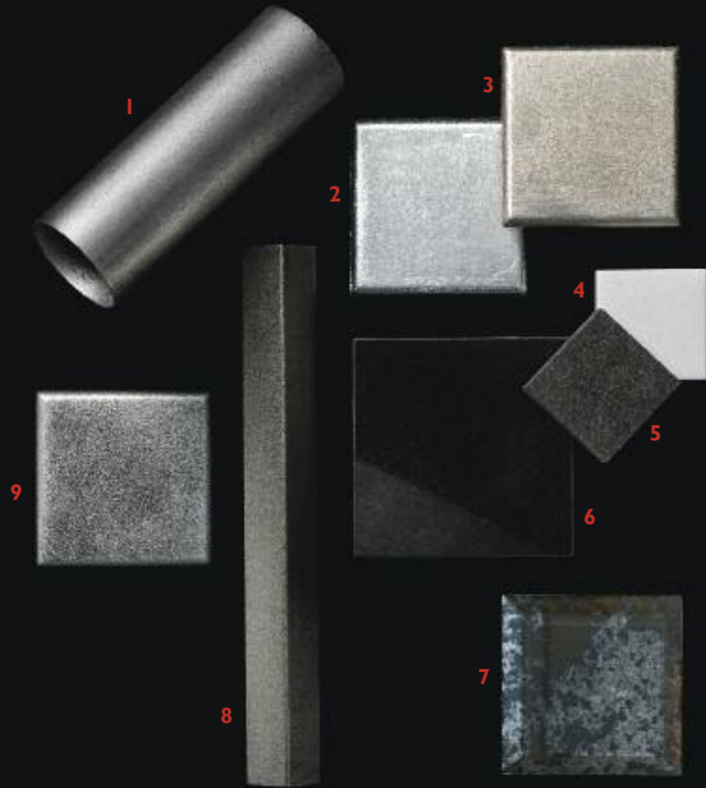
1 London Pewter 2 Silver Leaf 3 Platinum Leaf 4 Thassos Marble 5 Satino Granite 6 Nero Absoluto 7 Antique Mirror 8 English Pewter 9 Suffolk Pewter

Shown below is our standard range of paint finishes and materials in our extensive silver collection. If however you require alternative finish combinations we are able to offer this on most of our ranges. Please contact us.